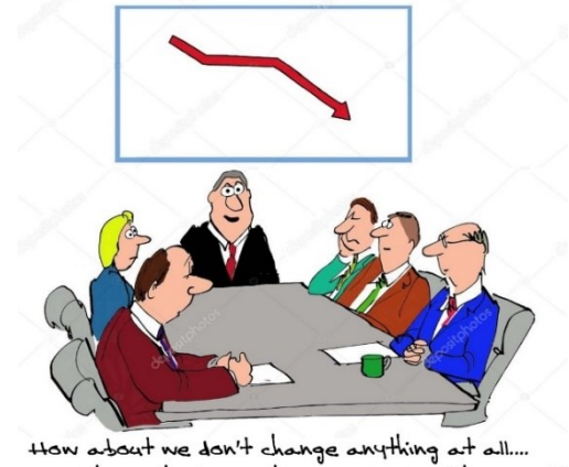
and hope that something magical just he